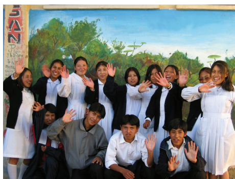
Teachers and students of 1,000 primary and secondary schools are the main focus of the programme.

The programme is directly advised by IICD and its partners in Bolivia. Since 2003, IICD together with Global E-schools and Communities Initiative and the Spanish